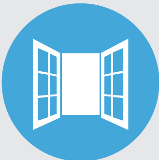
VENTILATE WORK AREAS WHERE POSSIBLE