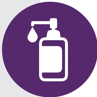
HAND SANITISER WILL BE USED REGULARLY