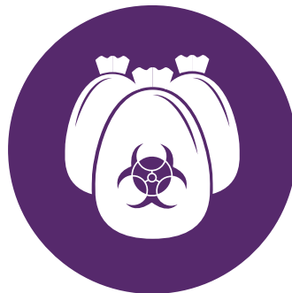
DISPOSE OF ALL WASTE APPROPRIATELY