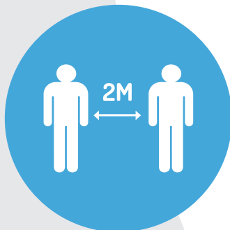
STAY 2 METRES DISTANCE FROM PEOPLE