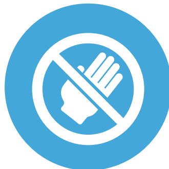
WE OPERATE A NO CONTACT POLICY