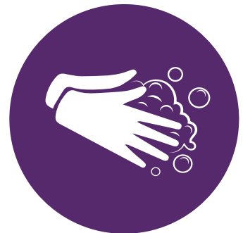
OPERATIVES HANDS WILL BE WASHED REGULARLY